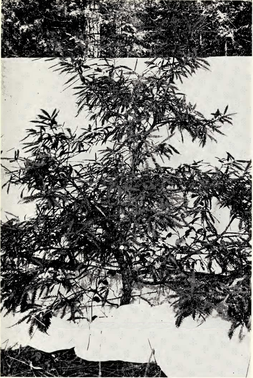
FIG. 2. A large shrubby mutant of Lithocarpus densiflorus .

(fig. 3). This was in the progeny of tree number 0-5. There can be no doubt, therefore, that these peculiar little plants are forms of Lithocarpus densiflorus , and, provided the hypothesis is correct, it is thus established that tree number 0-5 is heterozygous.